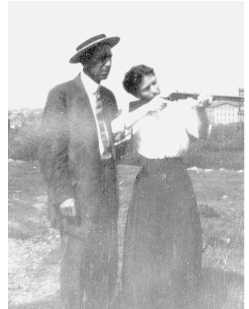
Decoration Day 1914