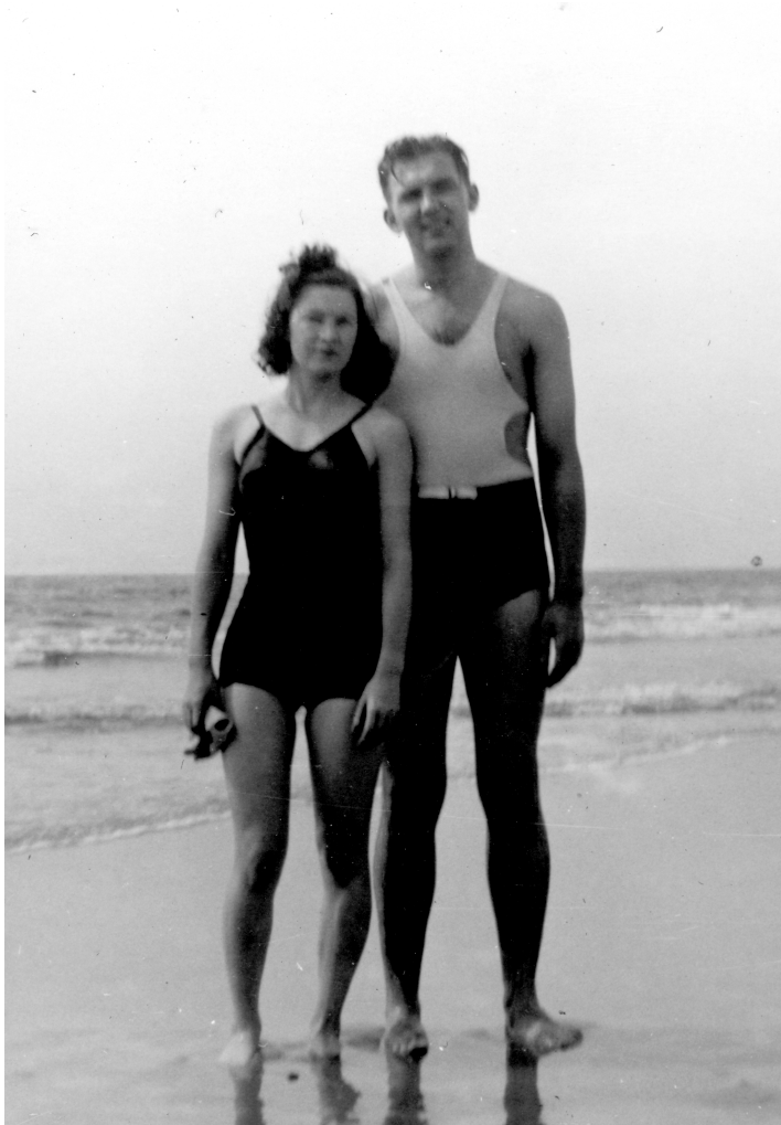
Atlantic City August