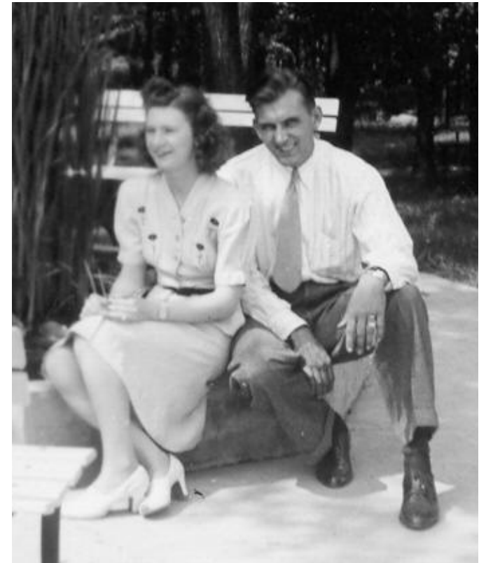
Honeymooning in Gettysburg