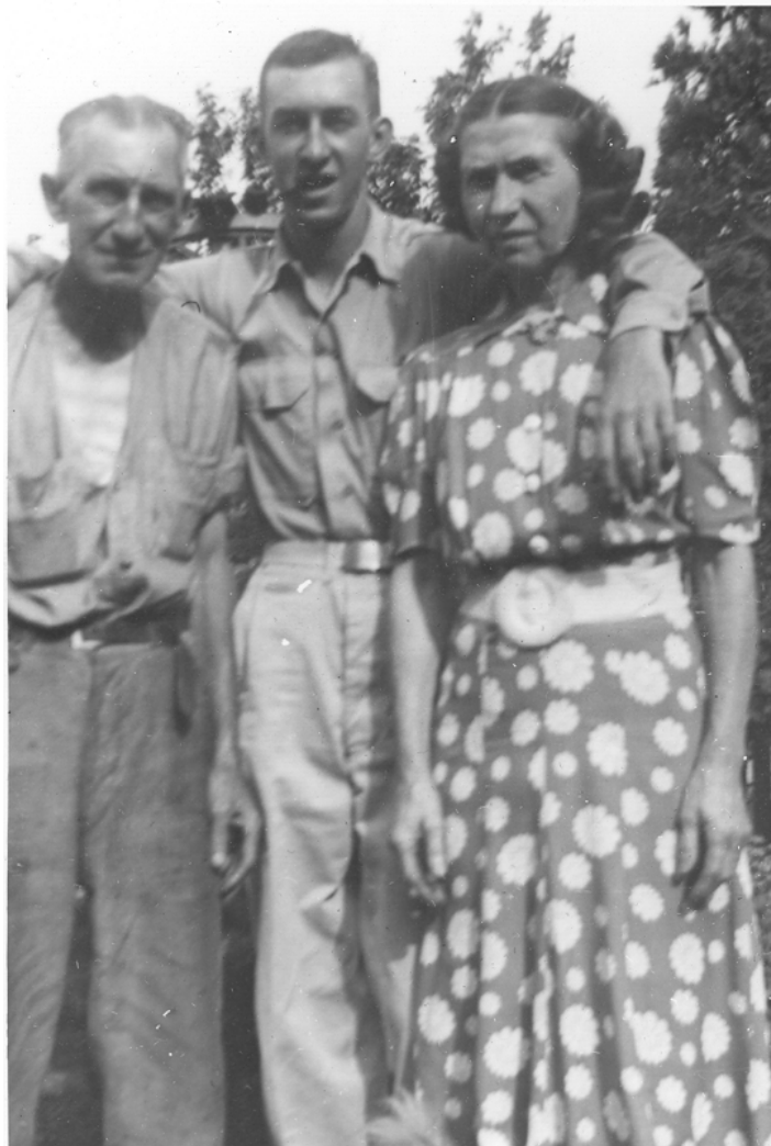
January 24, 1943. Perhaps leaving for the Army?