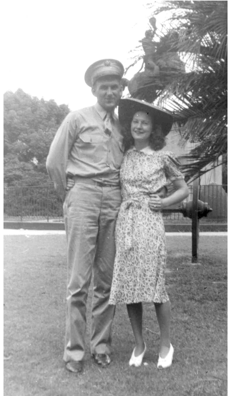
New Orleans 1942